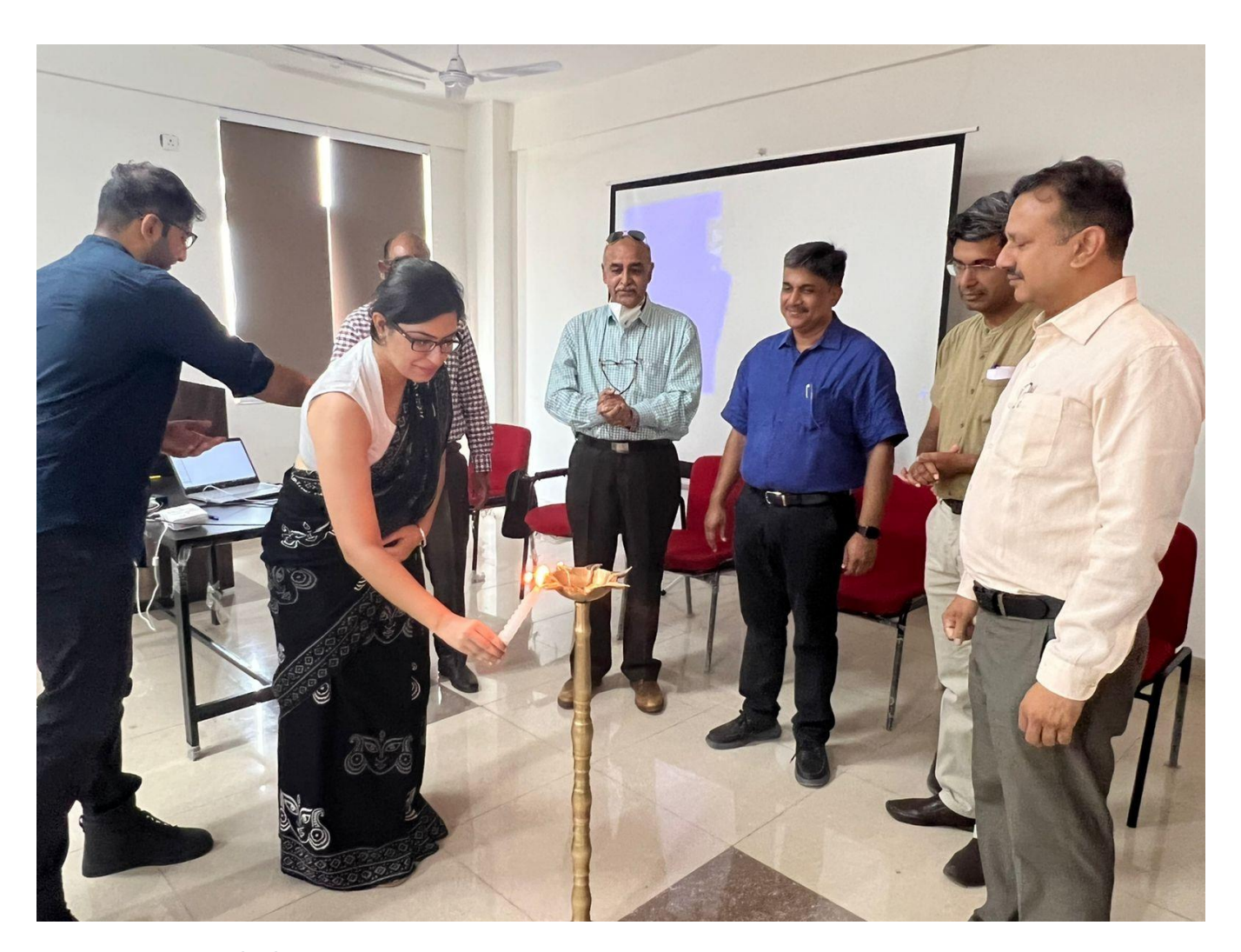
Figure 1 Lamp-lighting ceremony