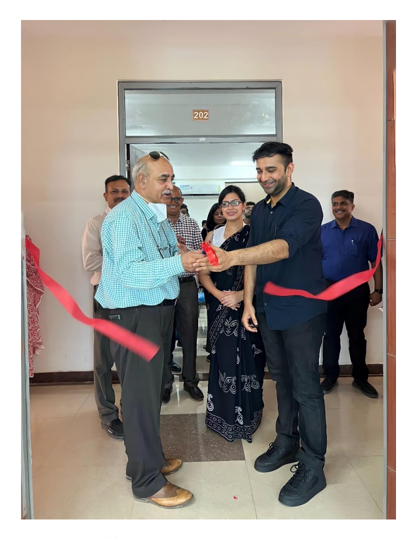
Figure 2 Ribbon-cutting ceremony