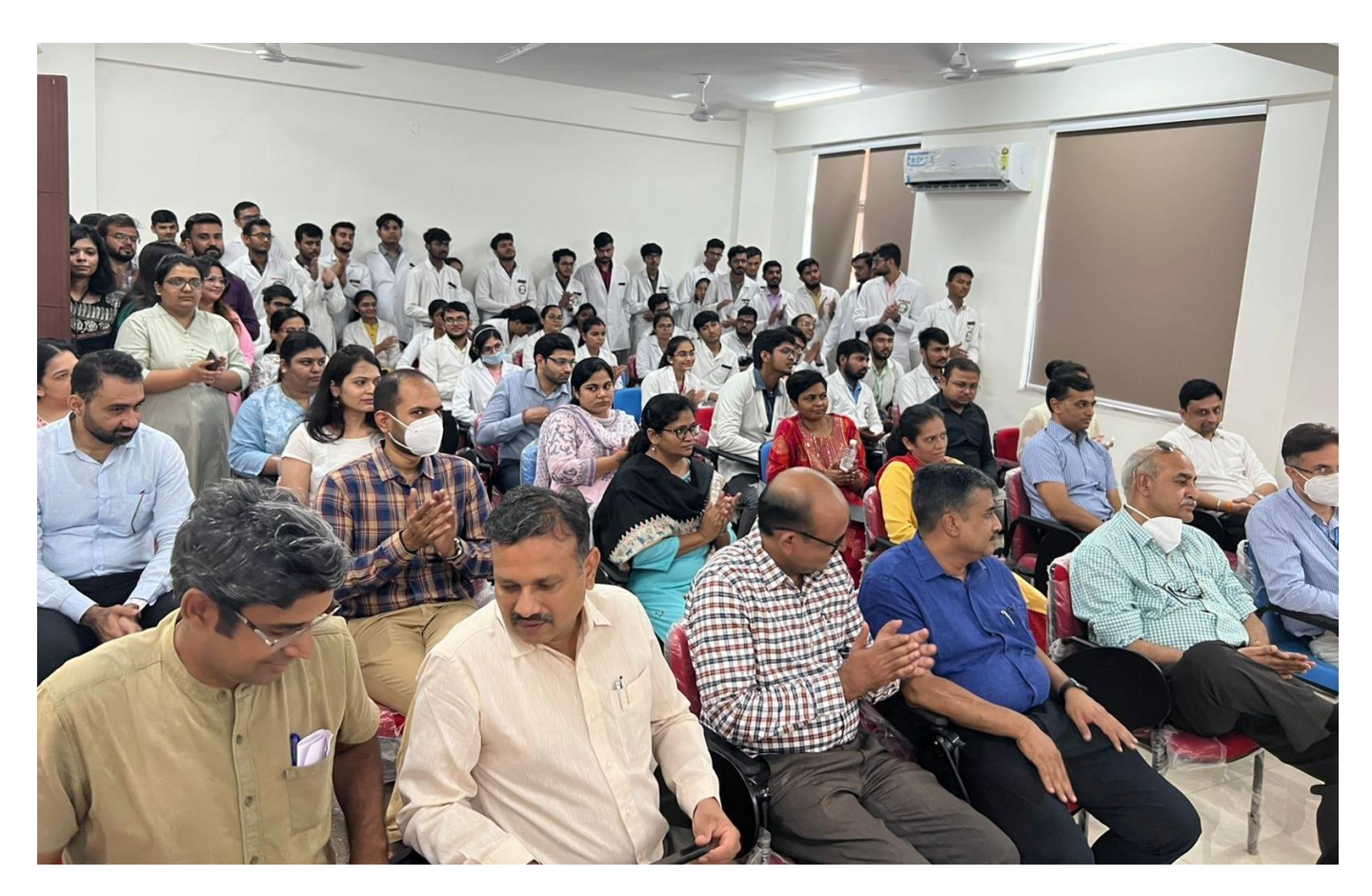
Figure 4 Support and enthusiasm shown by AIIMS Rajkot faculty and students